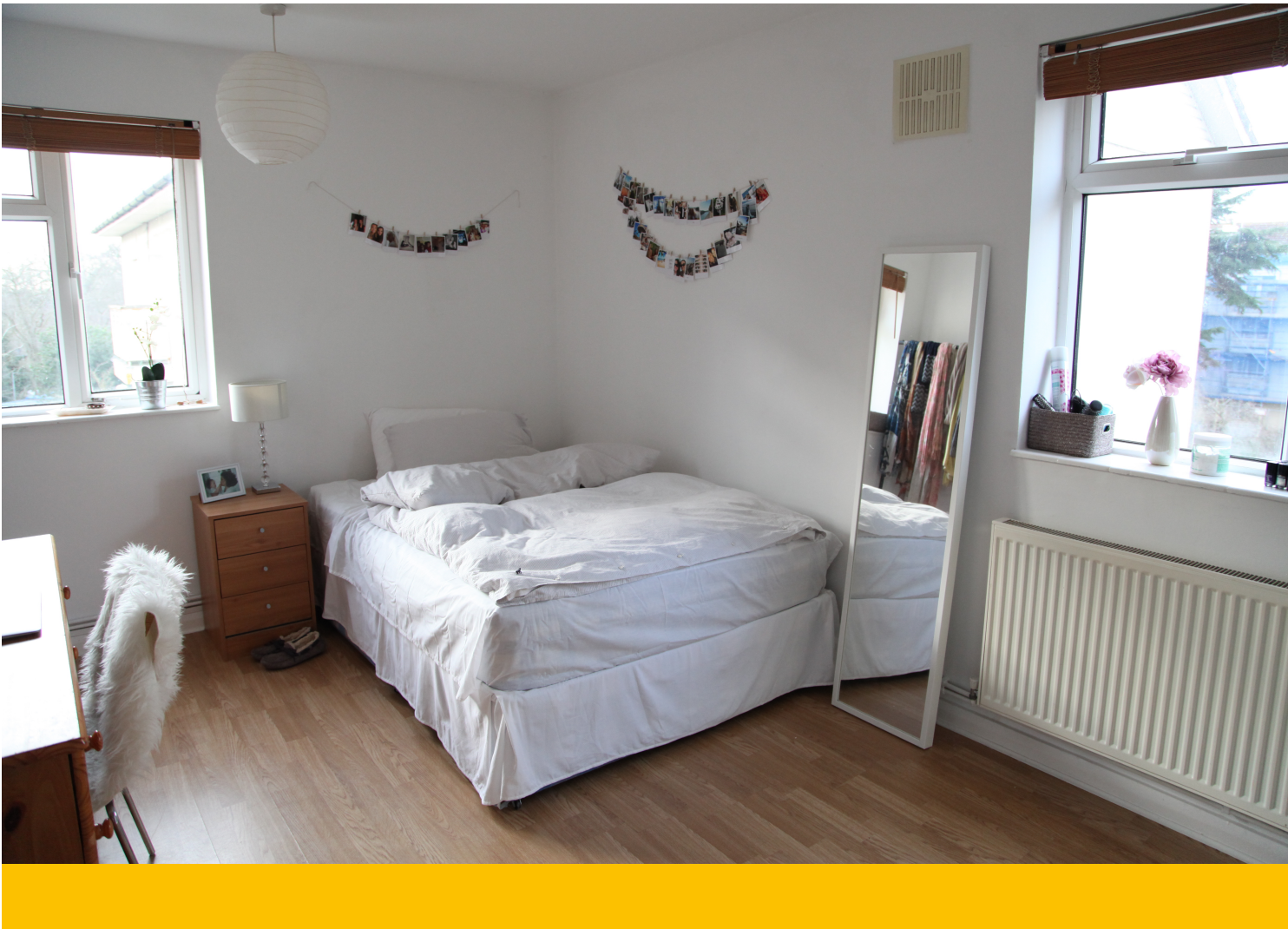
This top-floor furnished flat in Farleigh House benefits from a modern and bright eat-in kitchen, four bedrooms, a spacious reception room with access to the private balcony, and a bathroom with storage and separate WC. The development also offers communal gardens and parking.