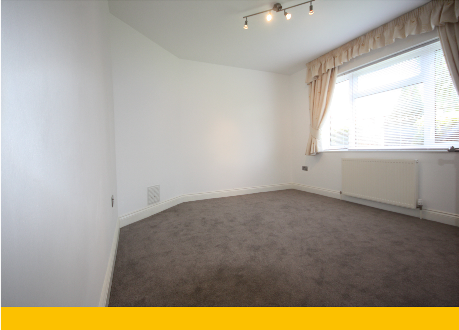
A lovely ground floor flat in a secure gated development near to Kingston Town Centre. The flat features a good size reception, two double bedrooms, newly fitted bathroom and kitchen. Finished to an excellent standard throughout.