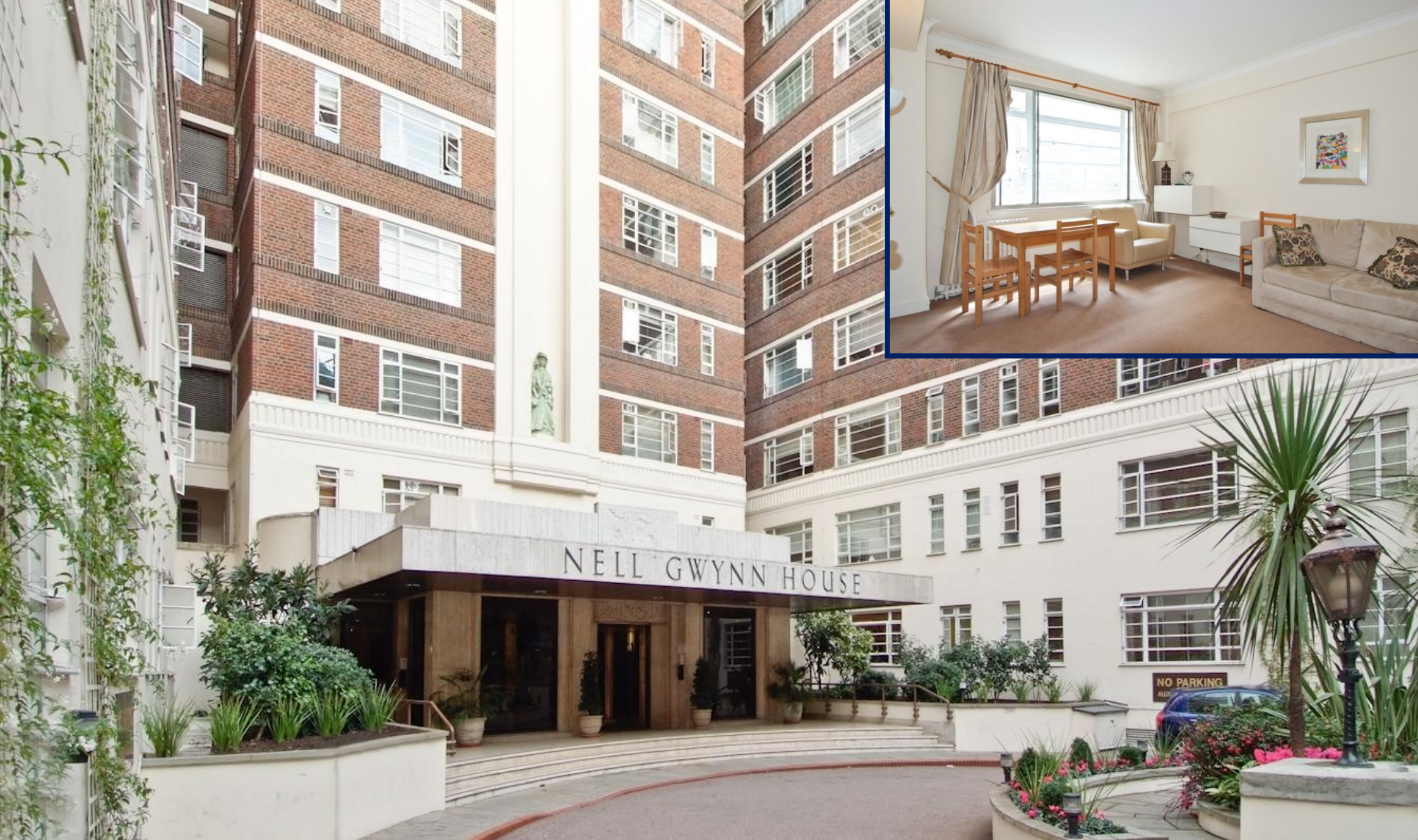
329 Nell Gwynn House SLOANE AVENUE, SW3