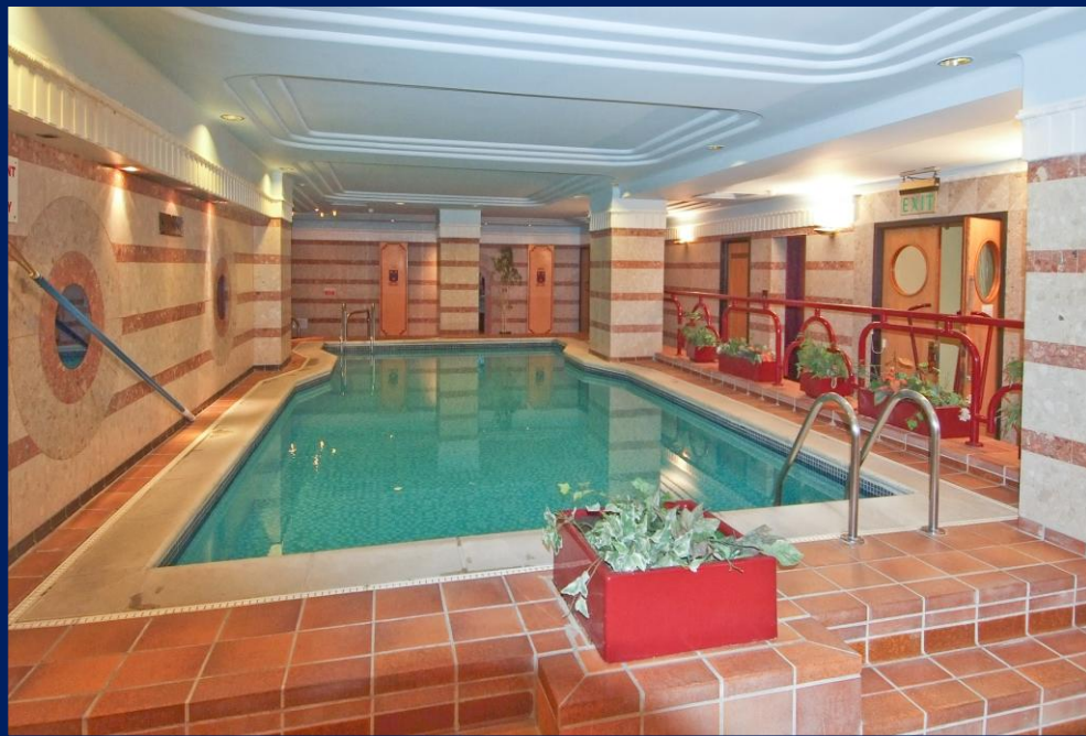
66 Florin Court Charterhouse Square. EC1M