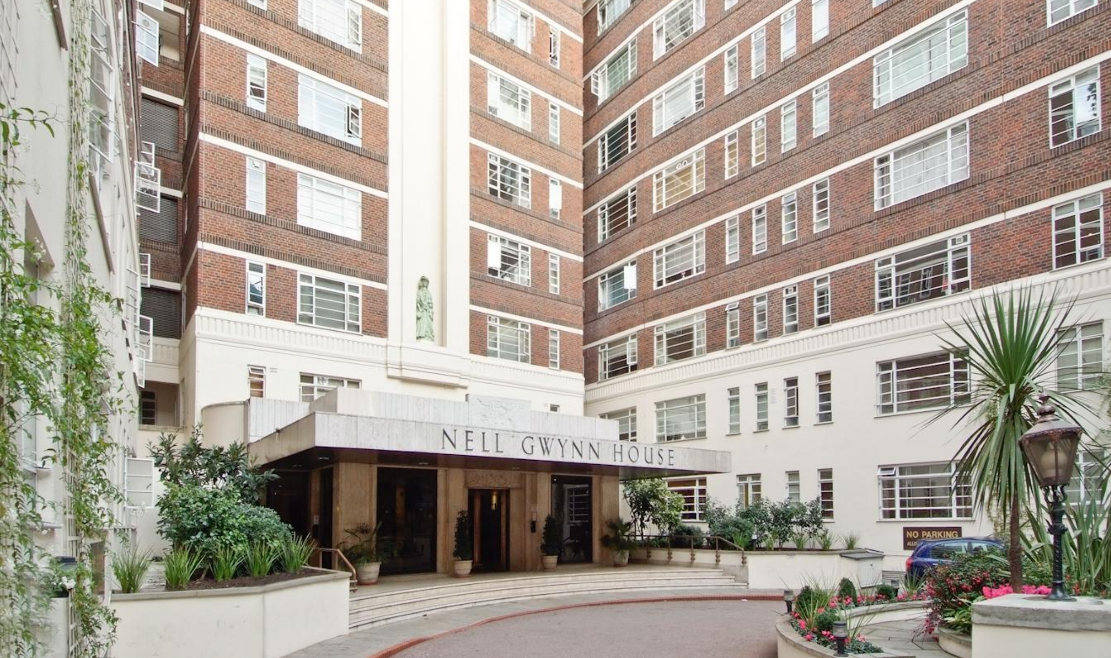
406 Nell Gwynn House SLOANE AVENUE, SW3